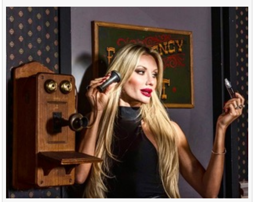
The brand has two skincare lines made in Italy and a complete professional makeup line.

This press release can be viewed online at: https://www.einpresswire.com/article/610386592 EIN Presswire's priority is source transparency. We do not allow opaque clients, and our editors try to be careful about weeding out false and misleading content. As a user, if you see something