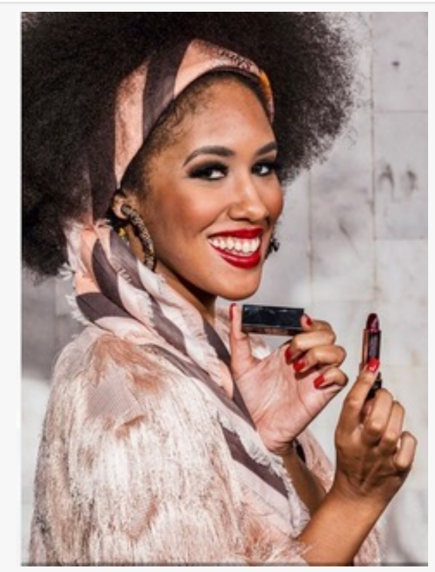
Bella Mademoiselle natural ingredients suitable to all skin types and waste free innovative packaging.

Trang Tran Planet Fashion TV +1 786-529-7388 vip@planetfashiontv.com Visit us on social media: Instagram Other