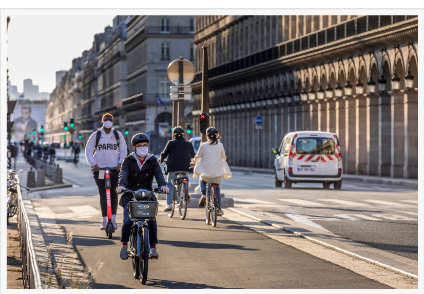
Cyclists using a dedicated bike lane in Paris, France.

NEW YORK, NEW YORK, UNITED STATES, January 10, 2023 /EINPresswire.com/ -- The Institute for Transportation and Development Policy (ITDP) and the Sustainable Transport Award Committee are proud to announce Paris, France as the winner of the 2023 Sustainable Transport Award (STA). Paris will receive the award in a live broadcast