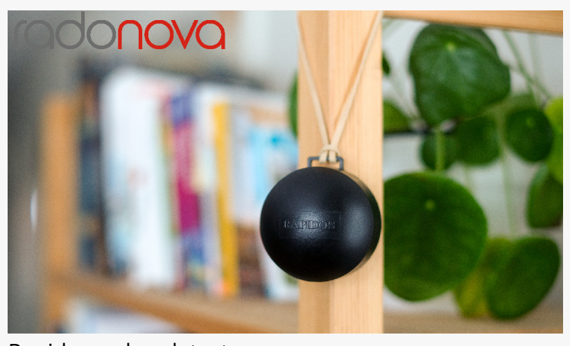
Rapidos radon detector