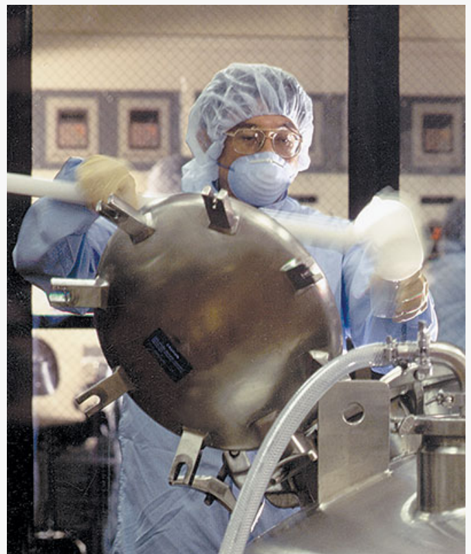
Plasma Protein Therapeutics Market

North America & Europe constitute around 65% of the global plasma protein therapeutics market, out of which North America is expected to lead the global market during the forecast period. A large number of geriatric patients along with patients suffering from chronic diseases