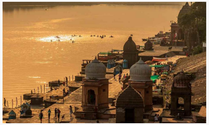
The temple town of Maheshwar

The highlights of Madhya Pradesh include the temples of <u>Khajuraho</u> which are India's unique gift to the world, representing, as they do, a paean to life, love, to joy; perfect in execution and sublime in expression. In Bhimbetka, vivid panoramic paintings in over 500 caves depict the life of the prehistoric cave dwellers, making it an archaeological treasure