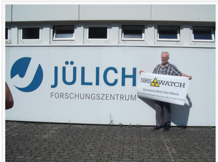
SRS Watch protests export of spent fuel from Jülich to SRS