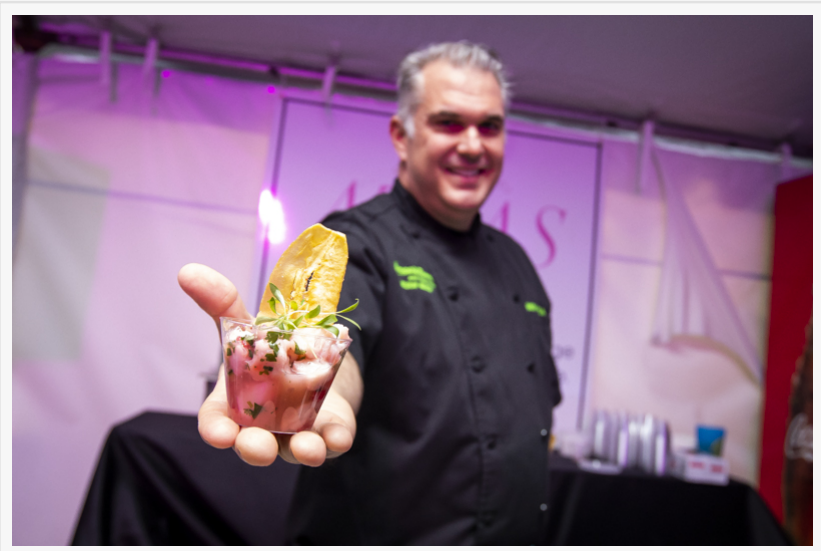
Game Set Pour Pic 2

About The Delray Beach Open: The only tournament in the world featuring