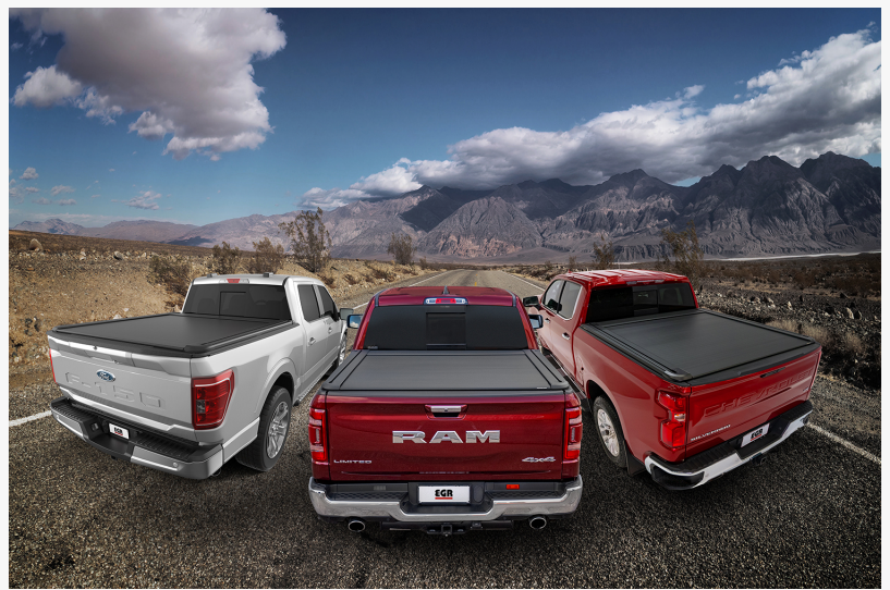
EGR USA offers electric retractable bed covers for most late model trucks.