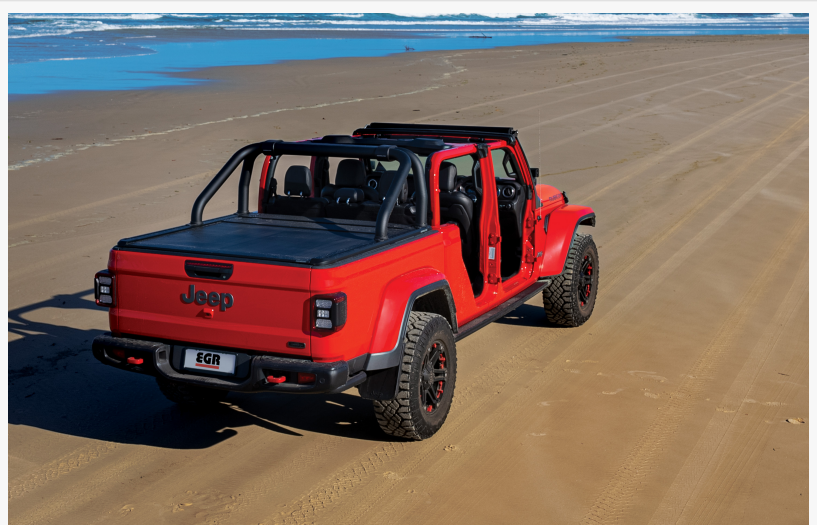
Photo of the EGR RollTrac for the Jeep Gladiator

EGR USA offers a full line of quality truck accessories including electric and manual EGR RollTrac tonneau covers, SuperGuard hood guards, Slimline window visors, Premium flares, Baseline flares, body side moldings, cab spoilers, sport bars, and other accessories. They offer a full line of accessories for top makes including Acura, Cadillac, Chevrolet, Dodge, Ford, GMC, Honda, Hummer, Hyundai, Jeep, Kia, Lincoln, Mazda, Nissan, Ram, Subaru, and Toyota.