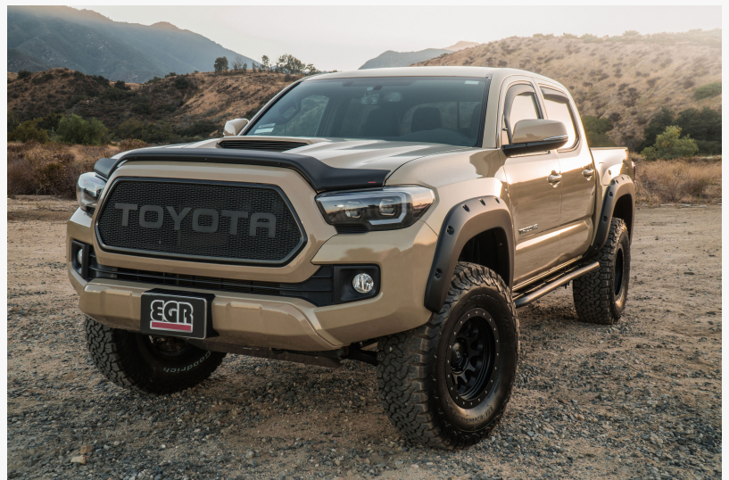
EGR USA makes a large range of precision engineered truck accessories for late model trucks and SUVs.

This press release can be viewed online at: https://www.einpresswire.com/article/610564529