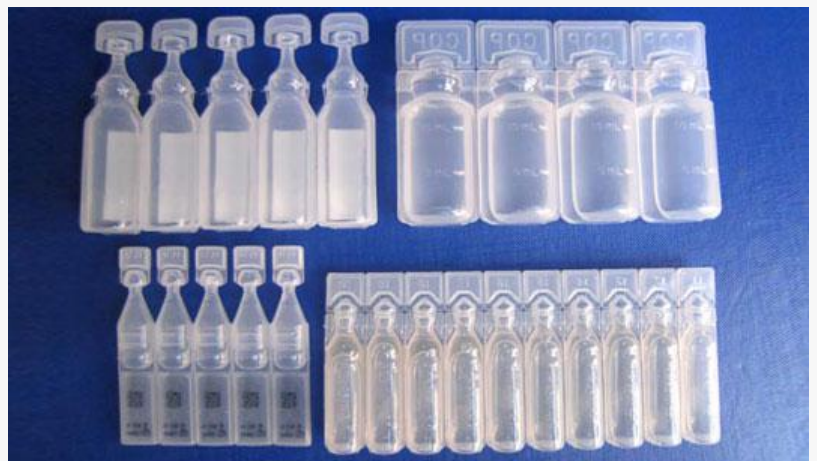
Latin America Blow Fill Seal Technology Market