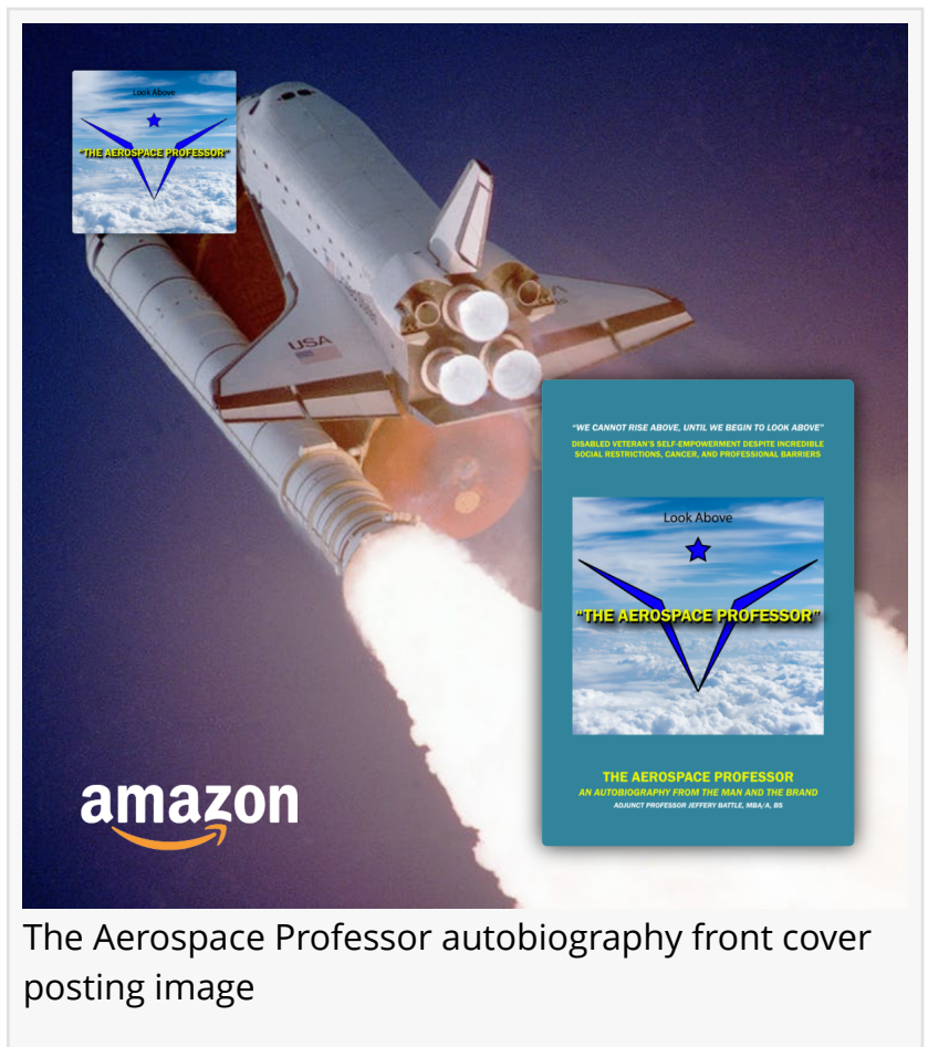
The Aerospace Professor autobiography front cover posting image

This press release can be viewed online at: https://www.einpresswire.com/article/610741892 EIN Presswire's priority is source transparency. We do not allow opaque clients, and our editors try to be careful about weeding out false and misleading content. As a user, if you see something we have missed, please do bring it to our attention. Your help is welcome. EIN Presswire, Everyone's Internet News Presswire™, tries to define some of the boundaries that are reasonable in today's world. Please see our Editorial Guidelines for more information. © 1995-2023 Newsmatics Inc. All Right Reserved.