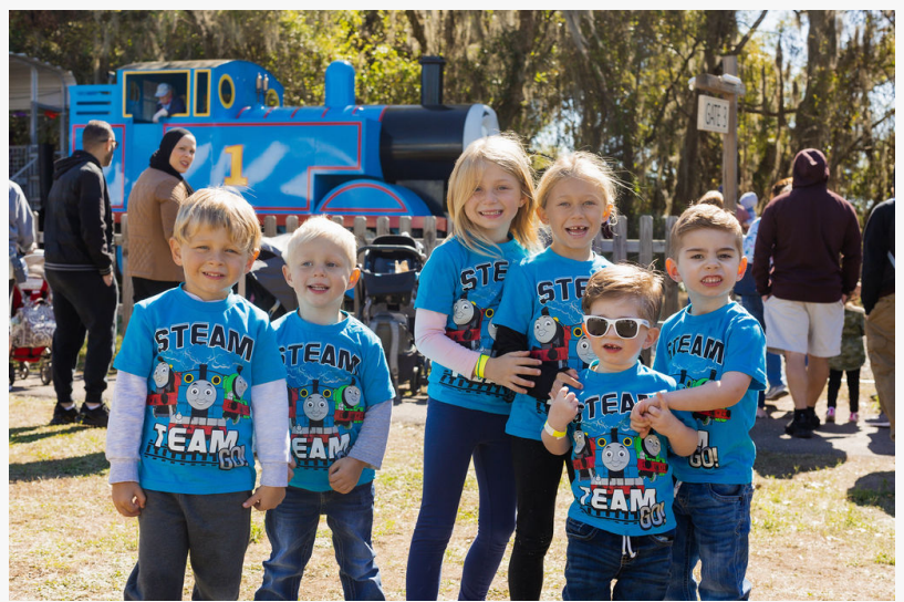
Thomas Fans at the Florida Railroad Museum

For more information about Thomas & Friends please visit: www.thomasandfriends.com , www.facebook.com/thomasandfriends and for bonus material and exclusive content www.youtube.com/user/thomasandfriends .