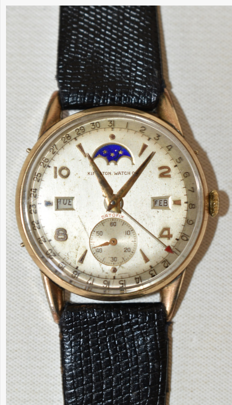
Wristwatches will feature this rare, circa 1940 Kingston moon phase chronograph wristwatch.