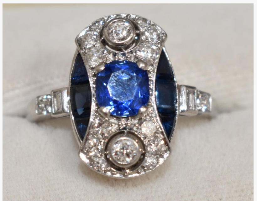
Very rare, circa 1910-1920 Art Deco Pailin natural blue sapphire and diamond evening ring set in platinum, with GIA report.

Also offered will be a circa 1920-1930 Art Deco 1.05-carat emerald cut platinum and diamond ring; an exceptional circa 1940-1950 enameled 14kt diamond, emerald and ruby bumblebee cocktail ring; a rare 17th or 18th century French/Spanish 18kt filigree crucifix "Croix du Pardon" (cross of forgiveness); and a lovely 19th century Edwardian 14kt fire opal pendant (or brooch).