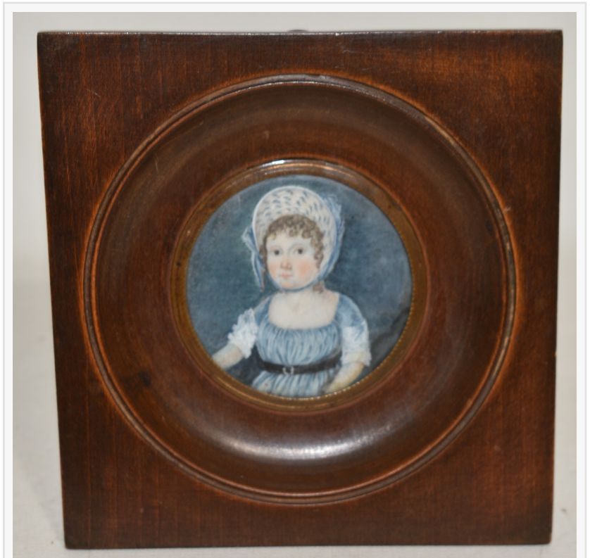
Decorative accessories will feature a fine selection of 18th-20th century portrait miniatures.

This press release can be viewed online at: https://www.einpresswire.com/article/610780178