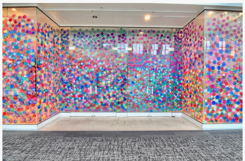
Holiday 2020 installation at The Westchester Mall, "Gumballs"