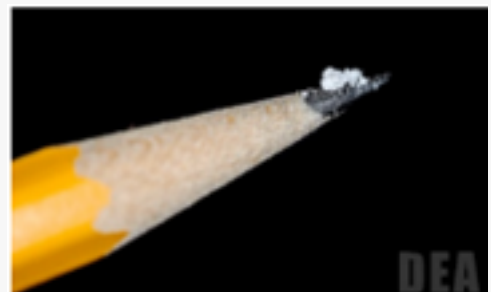
A lethal dose of fentanyl