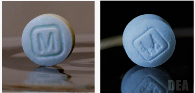
DEA photo of a counterfeit OxyContin (left) and genuine OxyContin (right). Can you easily tell the difference?