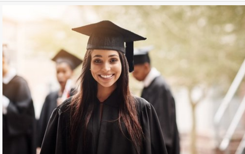
Ivy Central College Counseling