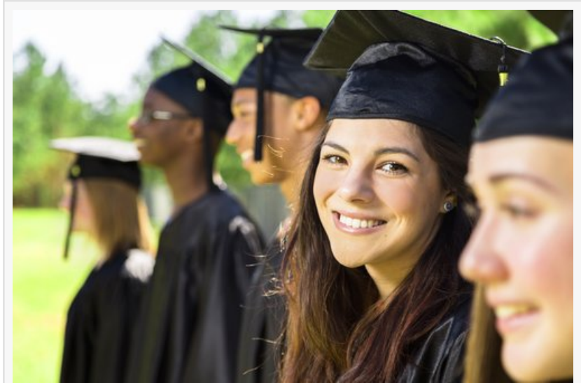
Get Into Your Top Choice College