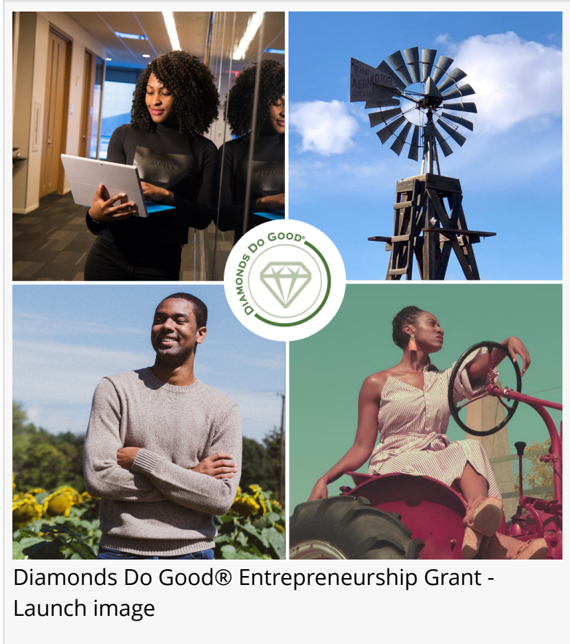
Diamonds Do Good® Entrepreneurship Grant - Launch image