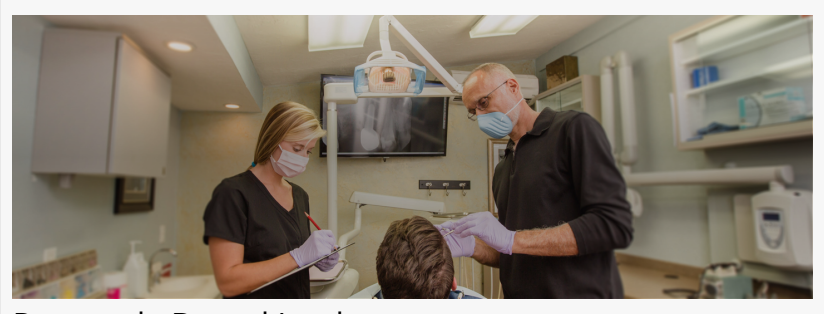
Pensacola Dental Implants