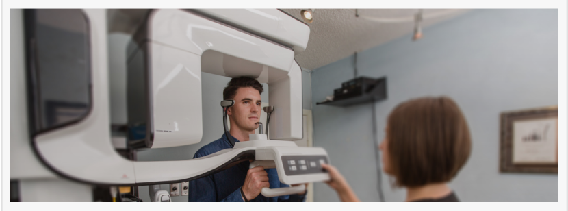
Pensacola Cosmetic Crowns