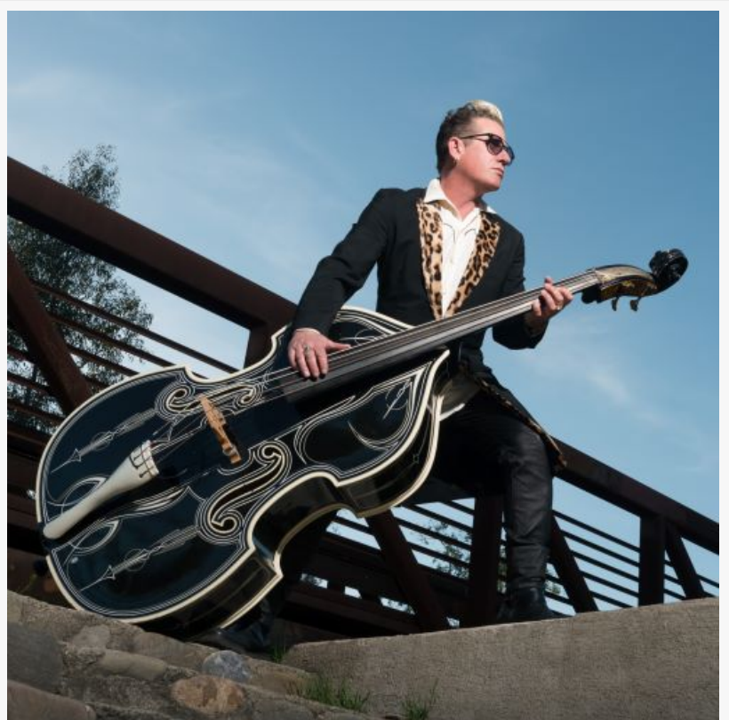
Lee Rocker of 'The Stray Cats'

Lee Rocker made his mark singing, playing, standing on, spinning, and rocking his giant upright bass as a founding member of the Grammy-nominated music group STRAY CATS. The Stray Cats sold over 10 million albums, garnered 23 gold and platinum-certified records, and were among the early music-video pioneers of MTV. Their songs have become a part of the fabric of rock and roll. The Rock and Roll Hall of Fame has included "Rock this Town" as one of the '500 Most-Important songs in Rock history.'