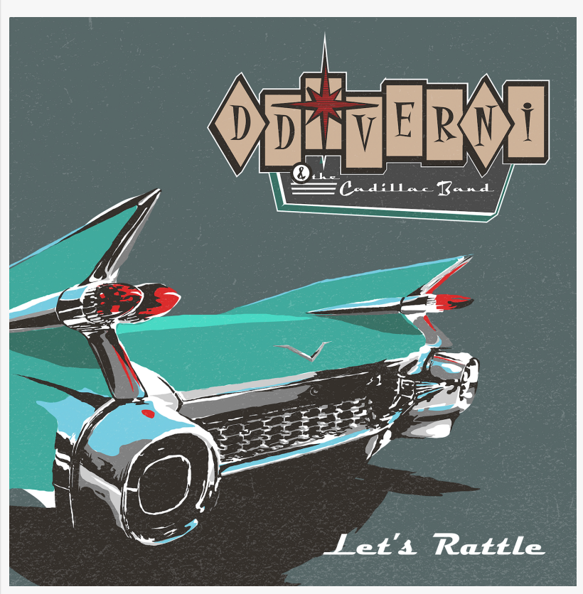
"Let's Rattle" - DD Verni & The Cadillac Band, album artwork