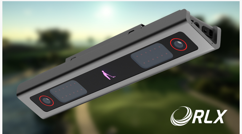
ProTee RLX Golf Launch Monitor