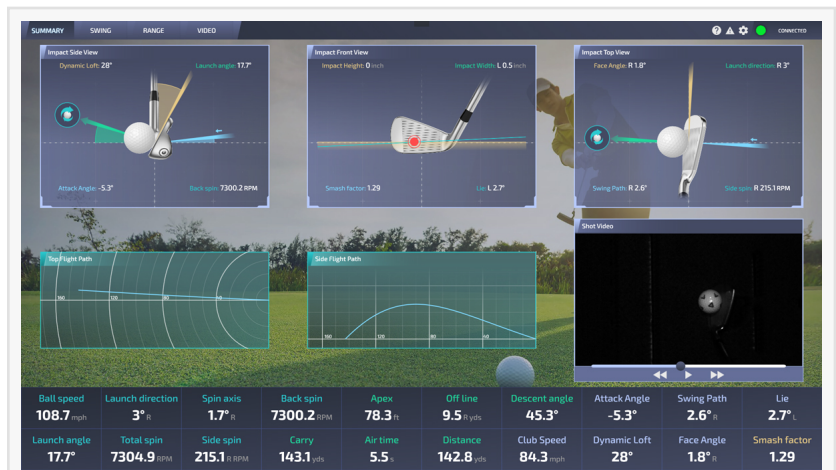
ProTee Golf Launch Monitor Shot Analysis Screen