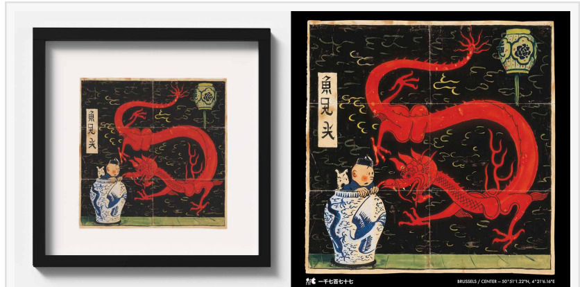
TINTIN - arteQ NFTs

Knowledge of the history is essential, because it is a source of value. The principle of the NFT* -