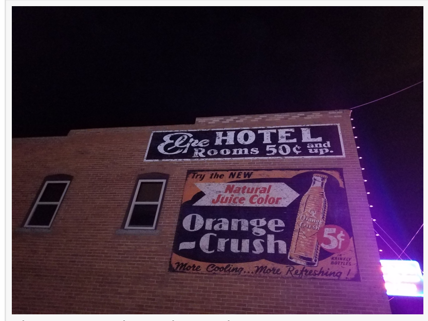
The Renovated Lincoln Hotel

Helper represents one of "the most remarkable projects of <u>urban</u> revitalization in the country and I think it is a model that other cities in Utah