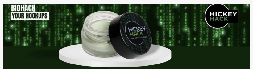
Hickey Hack: Get Rid of Hickeys