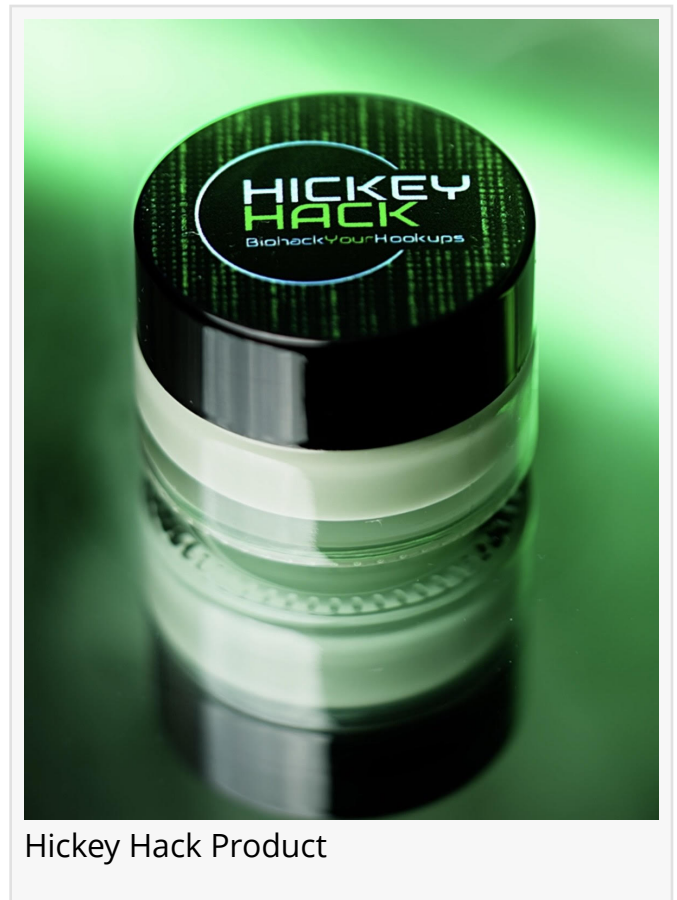
Hickey Hack Product

This press release can be viewed online at: https://www.einpresswire.com/article/611399035