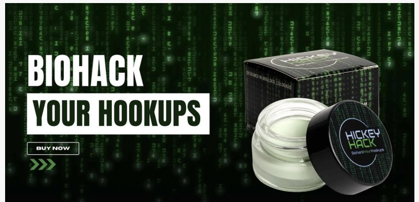
Hickey Hack Concealer

Parabens are a class of preservatives used in cosmetics and skincare products. While they effectively preserve your products, they come with several potential health risks that cannot be ignored. Here is a comprehensive look at the dangers of parabens and how the brand "Hickey Hack" avoids using them.