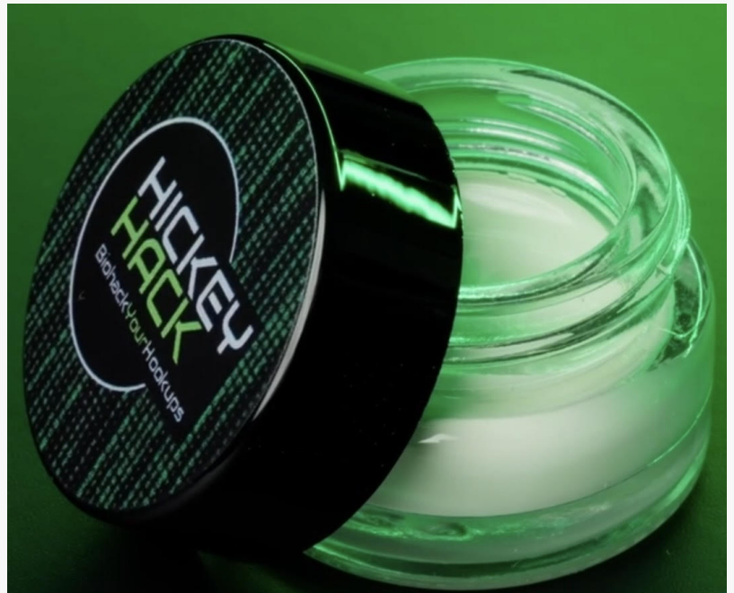
Hickey Hack HD