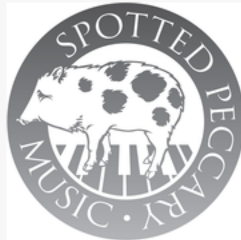
Spotted Peccary Music of Portland, OR

Spotted Peccary will live stream the album throughout the day of release on SPMLive: