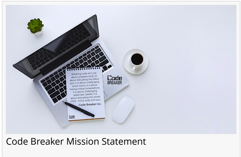
Code Breaker Mission Statement

Our mission is simple. Engaging students. Well, it is even more than that. We believe in investing in students' well being. We believe in educating the entire child – mind body and soul. We are