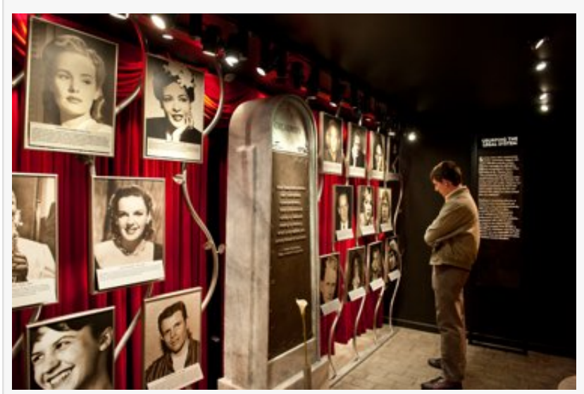
Harming Artists: Psychiatry an Industry of Death Museum

founder of Scientology, first brought psychiatric imprisonment to wide public notice: "Thousands and thousands are seized without process of law, every week, over the 'free world' tortured, castrated, killed. All in the name of 'mental health," he wrote in March 1969.