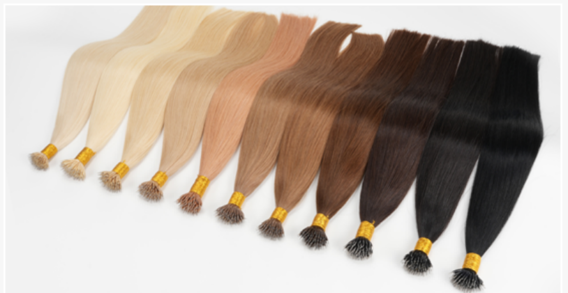
Wholesale Hair Extensions From Bono Hair