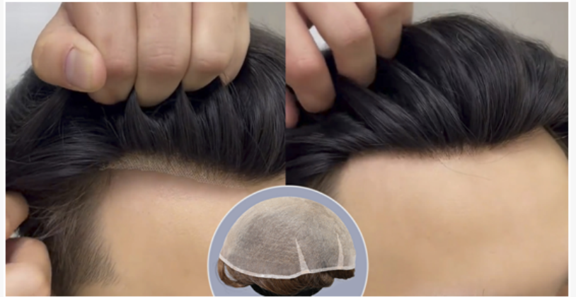
Bono Hair hair system

Bono Hair is the leading hair replacement manufacturer, which offers 100% human hair toupees and wigs. From the base to the human hair, high-quality raw materials are used for natural and durable products to hide hair loss or baldness. Secondly, there are professional sales to service each client, making them satisfied and comfortable. At last, if clients are unsatisfied with the product, Bono Hair will provide after-sales service. Thus there is no hesitation to make hair