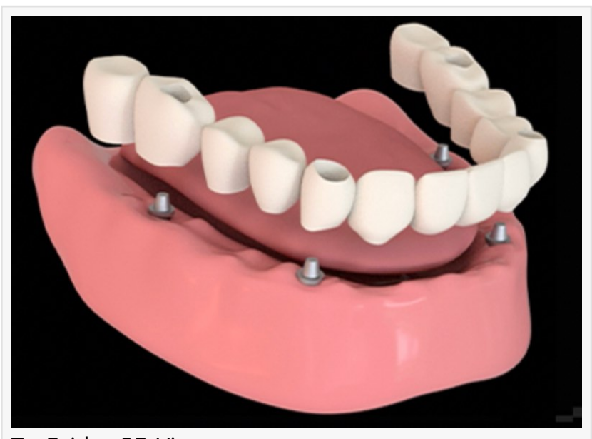
TruBridge 3D View

BAINBRIDGE ISLAND, WA, UNITED STATES, January 17, 2023 /EINPresswire.com/ -- In the sleepy little town of <u>Bainbridge Island</u>, approachable from the Emerald City of Seattle not by bridge but by ferry boat, a U.S. patent pending bridge of a different kind, one that installs gently over the gums and jawline of the human mouth, is making dreams come true.