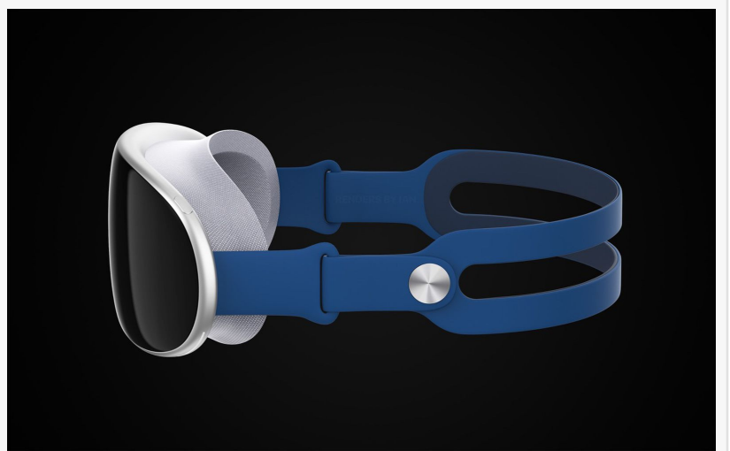
Virtual Reality Headset

UNITED STATES OF AMERICA, January 17, 2023 /EINPresswire.com/ -- With Apple finally wading into the murky waters of the Virtual & Augmented Reality space, can we expect to see an iPhone level revolution in the way that humans consume content? Better yet, let's view this entire space through the lens of musicians (forgive the bad pun). Because if history is to be trusted, the upcoming Apple virtual reality (VR) and augmented reality (AR) headset has the potential to revolutionize the way musicians promote & share music and the ways that fans consume music... forever.