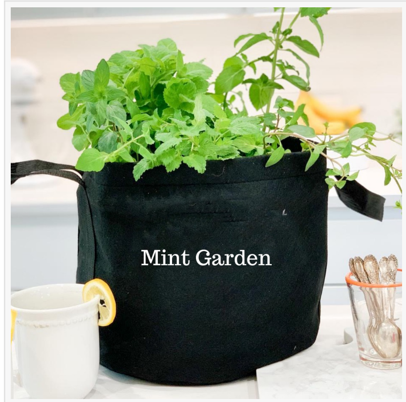
Is your love "mint to be?" Then send the Mint Garden from Gardenuity for Valentine's Day

• "Mint to be Together" Gardenuity Mint Garden: In all its varieties, mint is treasured by cooks and bartenders, beloved by gardeners, and cherished for its medicinal uses. Four fully rooted mint plants come along with a 3-gallon, reusable grow bag