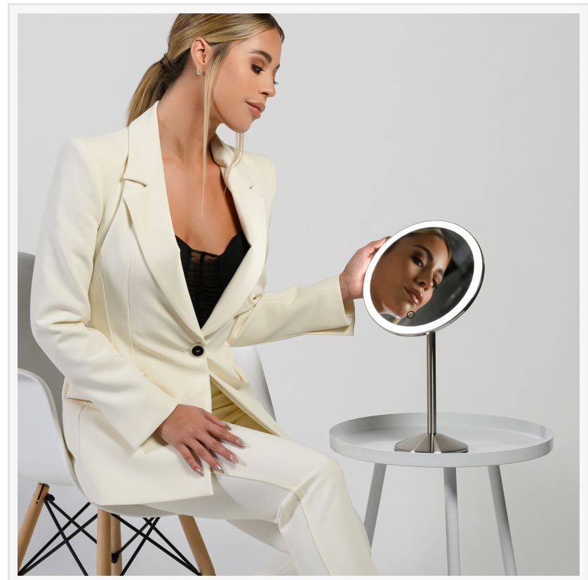
Standing taller than typical makeup mirrors and with 20% greater brightness, this portable mirror with a long-lasting rechargeable battery was thoughtfully built with convenience and quality in mind

Film and photography lighting industry expert Kelly Mondora launched Ilios Lighting in 2021 with the Beauty Ring as its signature product, following extensive research on the existing ring light market. Noting the absence of a daylight-inspired mirror bright enough