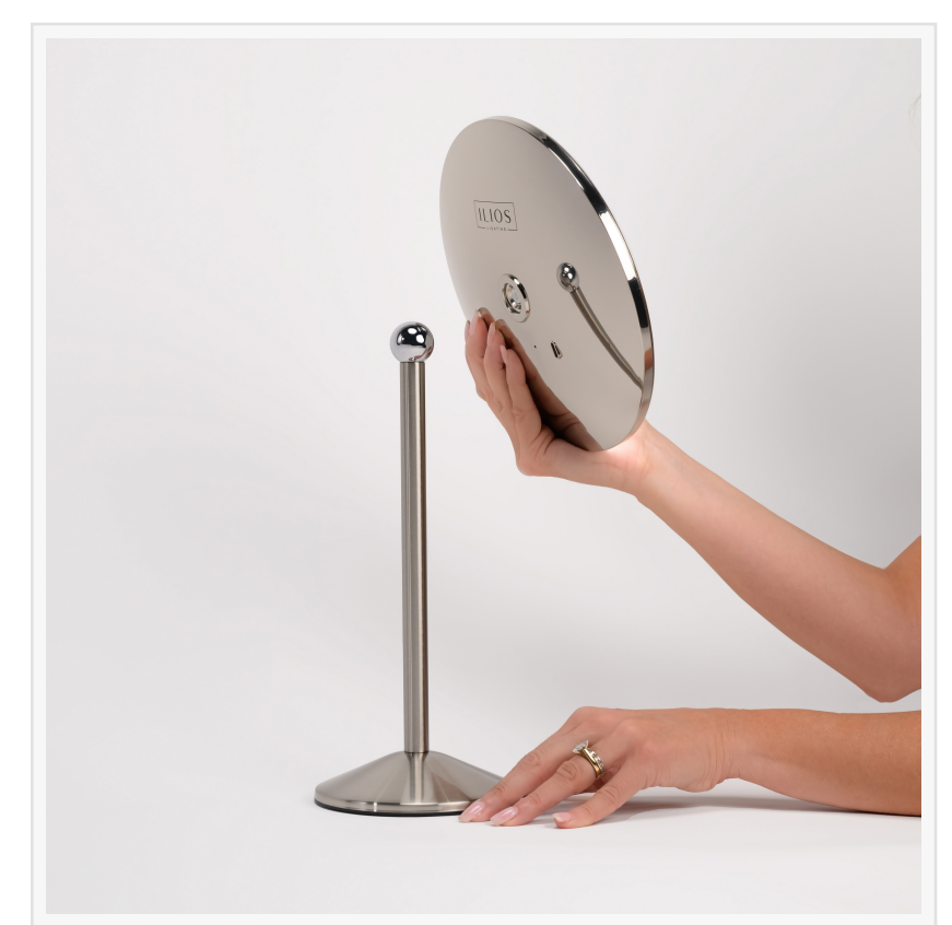
Quickly detach the mirror from its magnetic, tabletop base for handholding, or pair it with our convenient suction cup and take it along with you.

Kelly Mondora Ilios Lighting +1 419-766-8616 kelly@ilioslighting.co Visit us on social media: Facebook Instagram YouTube TikTok Other