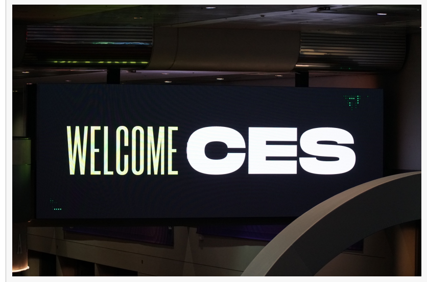
Welcome CES 2023