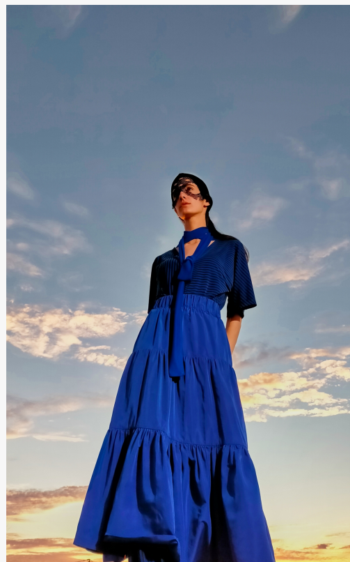
PORTUGAL FOR US - Shop Now