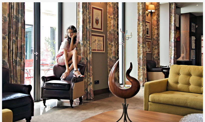
PORTUGAL FOR US - Unique designs made in Portugal