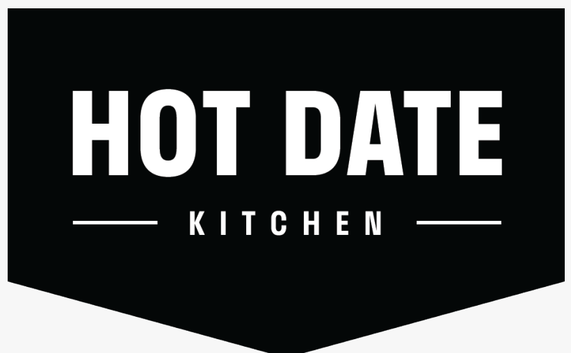
Hot Date Kitchen Logo