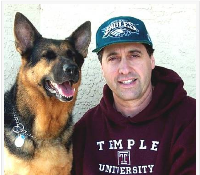
Steve Alten grew up in Philadelphia, earning his bachelor's degree in physical education at Penn State University, a master's degree in sports medicine from the University of Delaware and a doctorate in education at Temple University.