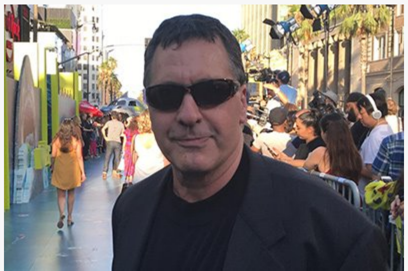
Bestselling author Steve Alten