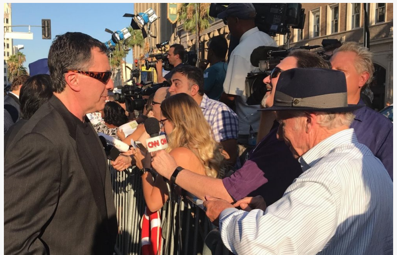
Steve Alten greets reporters at a movie premiere.