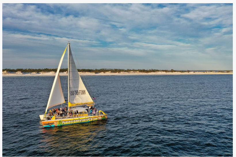
Paradise Adventures Catamaran Privateer

Panama City Beach is a major recreation destination within driving distance from other major cities like Atlanta, Georgia, Nashville, Tennessee, New Orleans, Louisiana and Birmingham, Alabama.