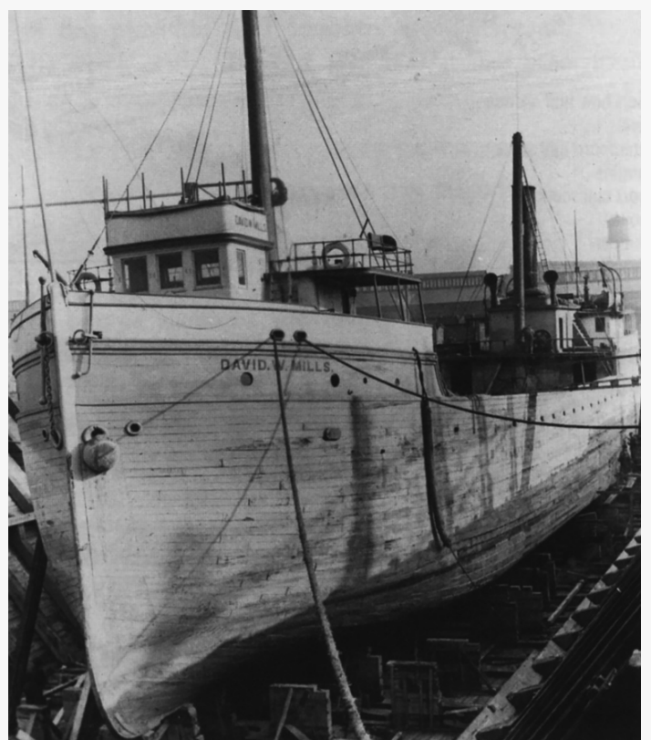
The wreck of the steamer David W. Mills, a typical 19th century cargo vessel, lies within the proposed sanctuary.

National Oceanic and Atmospheric Administration