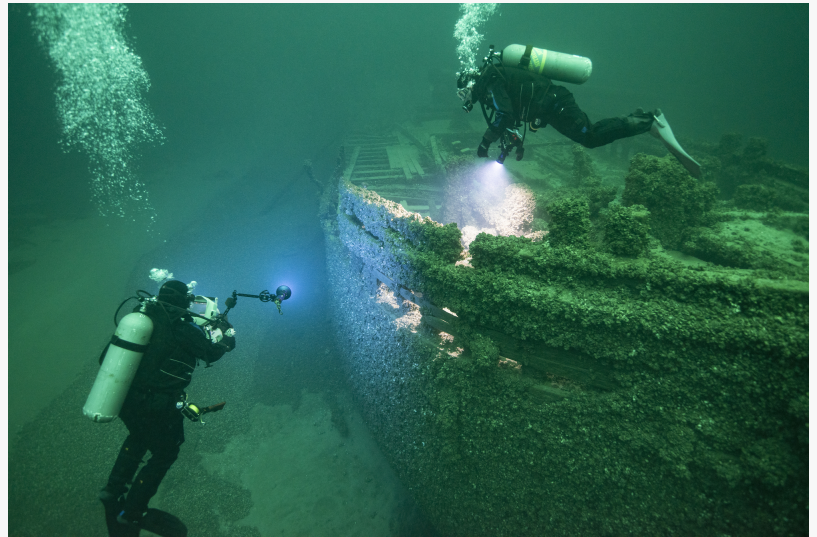
Two divers investigate the wreck of the St. Peter, one of the most visited recreationally accessible shipwrecks in the proposed Lake Ontario National Marine Sanctuary. The 135-foot, three-masted schooner rests upright in 117 feet of water.

In January 2017, leaders of four New York counties (Jefferson, Oswego, Cayuga, and Wayne) and the City of Oswego, with support from the Governor of New York, submitted a nomination to