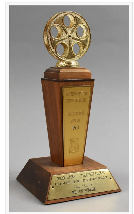
Lots 11-15 are Motion Picture Sound Editors Golden Reels Awards issued to Milton Burrow in the 1970s for his work on several TV shows and the film Birds of Prey (each est. $200-$2,000).

Lots 260-266 are Royal Copenhagen porcelain pieces in the blue fluted Half Lace pattern (dinner, bread, dessert and salad plates, cups and bowls), most dating from the 1950s-1960s. Estimates range from $100-$500. Also, a set of sterling flatware for eight from Gorham in the Buttercup pattern (1899-1950), most having the anchor and lion mark, plus a silver teaspoon from Alvin in the Chateau Rose pattern (1940) should hit $400-$1,000.