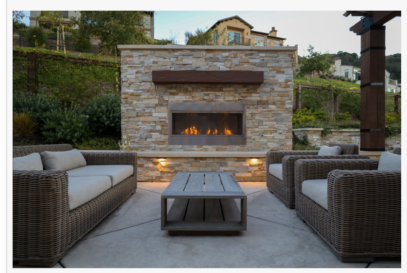
Mixing materials, colors and styles is one way we keep our designs unique and full of personality.

This press release can be viewed online at: https://www.einpresswire.com/article/612297189