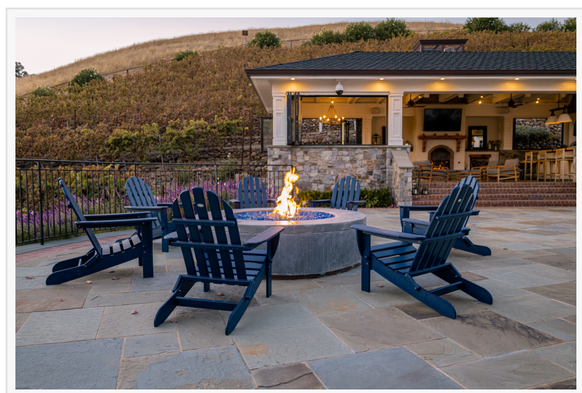
Outdoor fireplaces bring the comfort of the indoors to an outdoor living space.

ALAMO, CA, USA, January 27, 2023 /EINPresswire.com/ -- There is something instinctively wonderful about relaxing around a fire. As a result, it is included into most custom outdoor living spaces. Fire features can take on infinite forms and aesthetic styles to fit seamlessly into a designed space. Here are a few of the ways to use fire features as beautiful and functional elements in the landscape.