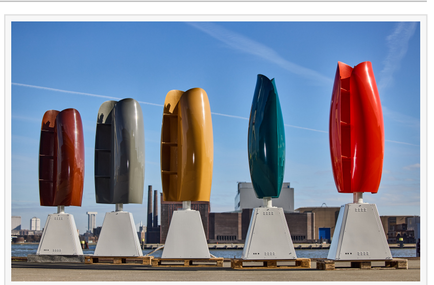
Bouquet of Wind Tulip Turbines

Technology being developed by Flower Turbines enables a new model in the small wind industry. Focused on creating beautiful, affordable, and