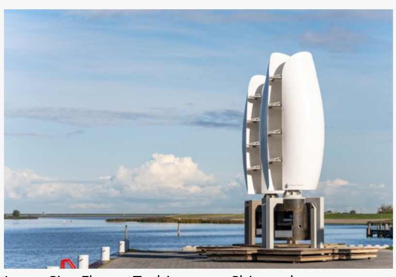
Large Size Flower Turbines at a Shipyard

efficient turbines for the urban/suburban market and tight spaces, it seeks to pave the way for the future of distributed energy, particularly with solar. Its "Cluster Effect" (whereby their turbines perform better when tightly packed together as opposed to the most common turbines which perform worse when tightly packed) could give them a key advantage to scaling farms of small wind turbines and harnessing the electricity they produce.