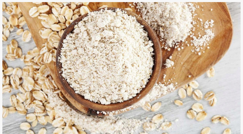
Functional Flour Market