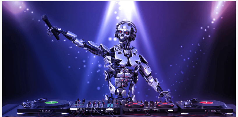
Is this next?

In terms of music creation, AI-powered tools can help musicians generate new songs and sounds in a faster and more efficient way. For example, AI-powered music composition software can analyze a musician's existing work and suggest chord progressions and melodies that complement it. This can help musicians to experiment with new sounds and styles, without