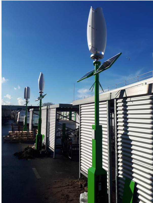
Wind and Solar E-bike Charging Poles

NO MONEY OR OTHER CONSIDERATION IS BEING SOLICITED, AND IF SENT IN RESPONSE, WILL NOT BE ACCEPTED. NO OFFER TO BUY THE SECURITIES CAN BE ACCEPTED AND NO PART OF THE PURCHASE PRICE CAN BE RECEIVED UNTIL THE OFFERING STATEMENT IS FILED AND ONLY THROUGH AN INTERMEDIARY'S PLATFORM. AN INDICATION OF INTEREST INVOLVES NO OBLIGATION OR COMMITMENT OF ANY KIND. "RESERVING" SECURITIES IS SIMPLY AN INDICATION OF INTEREST.