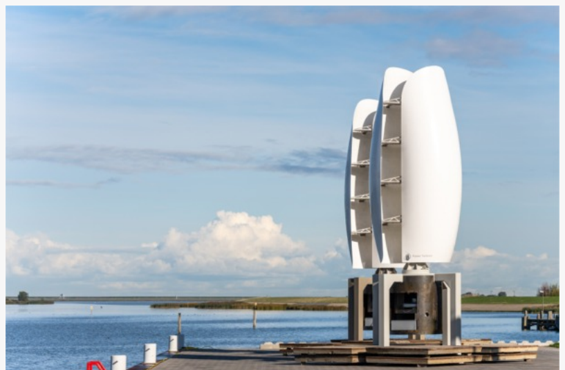
Large Size Flower Turbines at a Shipyard