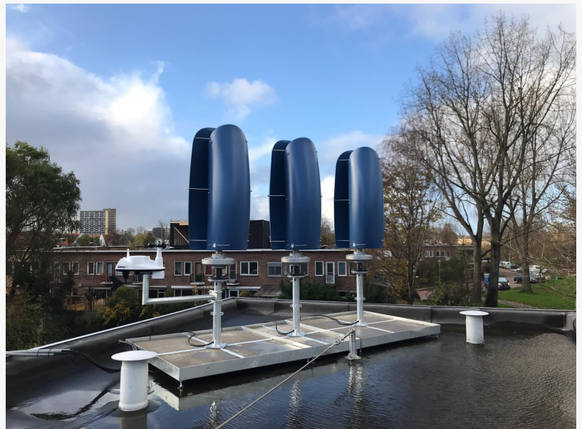
Three installed small size Wind Tulips