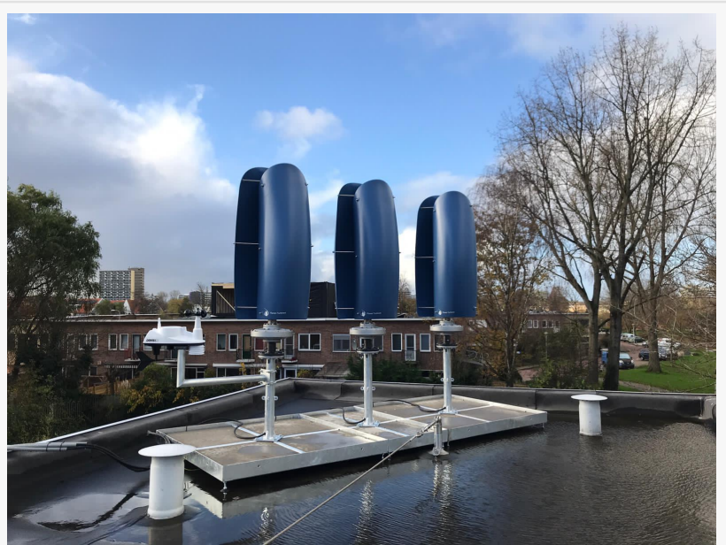
Three installed small size Wind Tulips