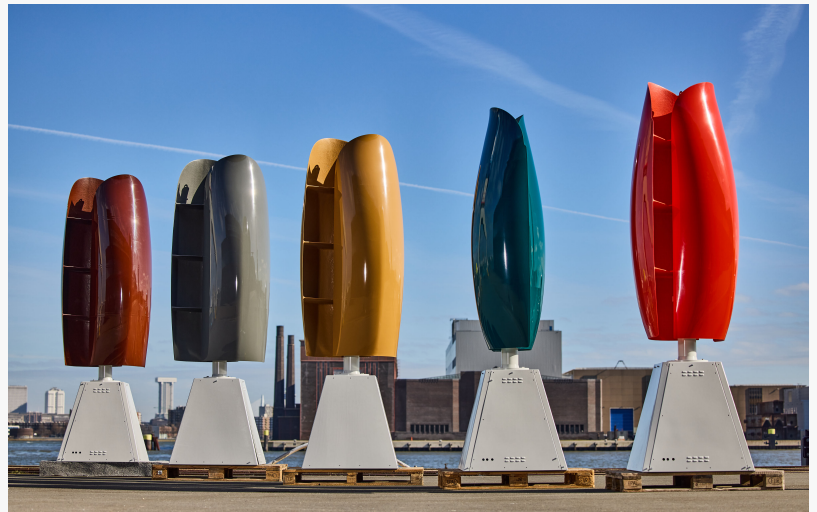
Bouquet of Wind Tulip Turbines

And you can buy or reserve products at https://www.flowerturbines.com/shop . If you are in the EU, you can buy by quotation with our staff at support.eu@flowerturbines.com Outside of that, contact support.us@flowerturbines.com for a custom quotation.