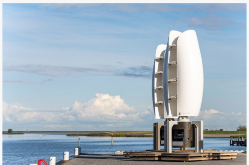
Large Size Flower Turbines at a Shipyard

This press release can be viewed online at: https://www.einpresswire.com/article/612605986