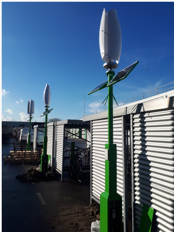
Wind and Solar E-bike Charging Poles