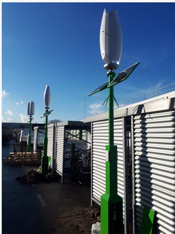
Wind and Solar E-bike Charging Poles

NO MONEY OR OTHER CONSIDERATION IS BEING SOLICITED, AND IF SENT IN RESPONSE, WILL NOT BE ACCEPTED. NO OFFER TO BUY THE SECURITIES CAN BE ACCEPTED AND NO PART OF THE PURCHASE PRICE CAN BE RECEIVED UNTIL THE OFFERING STATEMENT IS FILED AND ONLY THROUGH AN INTERMEDIARY'S PLATFORM. AN INDICATION OF INTEREST INVOLVES NO OBLIGATION OR COMMITMENT OF ANY KIND. "RESERVING" SECURITIES IS SIMPLY AN INDICATION OF INTEREST.