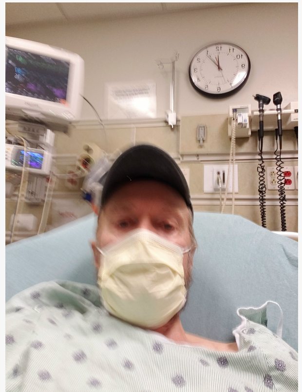
Emergency Room after Collapse