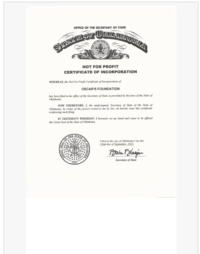
Certificate of Incorporation