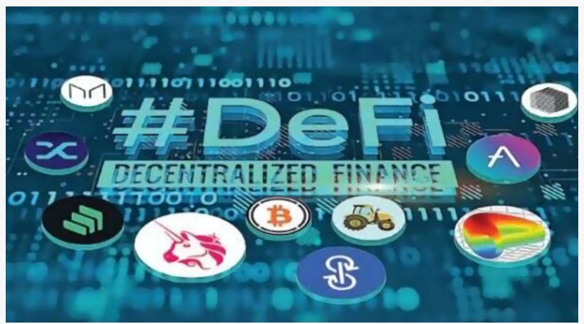
Global Decentralized Finance (DeFi) Market Size

Based on the application, the global decentralized finance (DeFi) market is segmented into data & analytics, compliance & identity, marketplaces & liquidity, assets tokenization, payments,