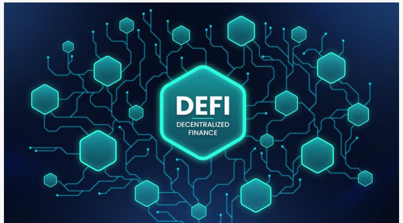
Global Decentralized Finance (DeFi) Market Share