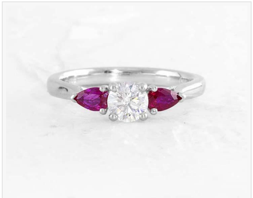
0.50ct Round Diamond 0.85ct Pear Ruby Three Stone Ring MD032

The unique bubble-style band adds a touch of whimsy and playfulness to this otherwise classic design. This ring is perfect for those who wish to make a statement of love that is both elegant and unique, a true expression of one's devotion. Allow this ring to symbolize the love and commitment that you share with your beloved, and do so in the most refined and timeless way possible.