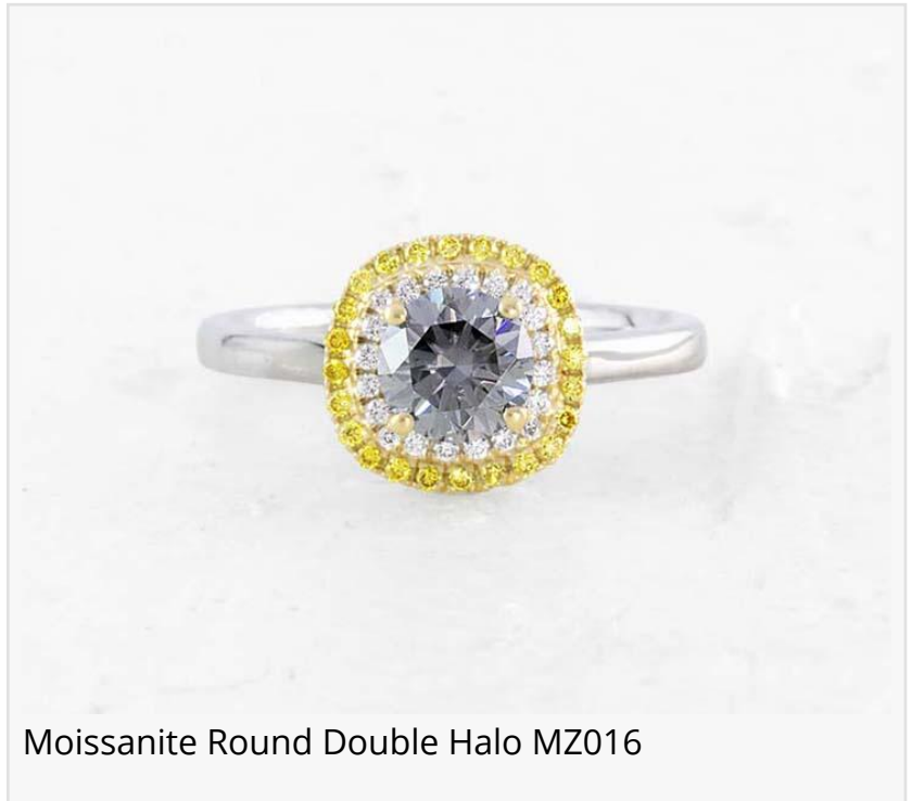
Moissanite Round Double Halo MZ016

DUBLIN, IRELAND, January 23, 2023 /EINPresswire.com/ -- Commins & Co embraced ChatGPT with mixed results. After finding that AI text was helpful in speeding things up but its quality of engagement ring descriptions didn't really compare with their own writing quality, they tried out training ChatGPT to act like celebrities which definitely made for more interesting results!