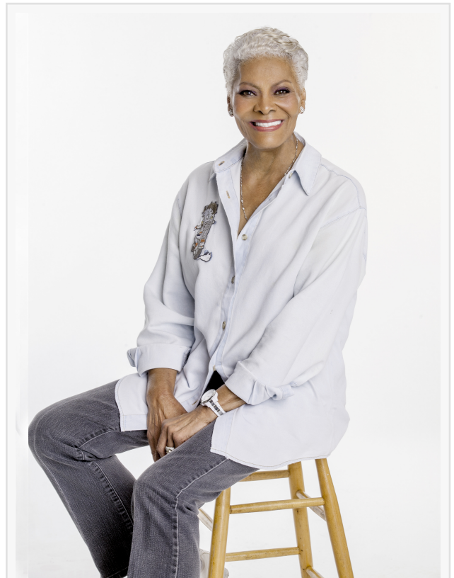
Dionne Warwick joins "HITS! The Musical" as Co-Producer

With her instantly recognizable voice and memorable songs, Warwick has been an icon of American pop music for more than 50 years and ranks #74 on the Billboard Hot 100’s “Greatest Artists of All Time.” An established international musical star, she is one of the most charted vocalists of all time. Warwick has more than 56 hit singles—12 in the top ten—and has sold more than 100 million records worldwide. In addition to her Grammy Awards, Warwick is the recipient of numerous other prestigious awards, including induction into the Hollywood Walk of Fame, the Grammy Hall of Fame, the R&B Music Hall of Fame and the Apollo Theater Walk of Fame. Three