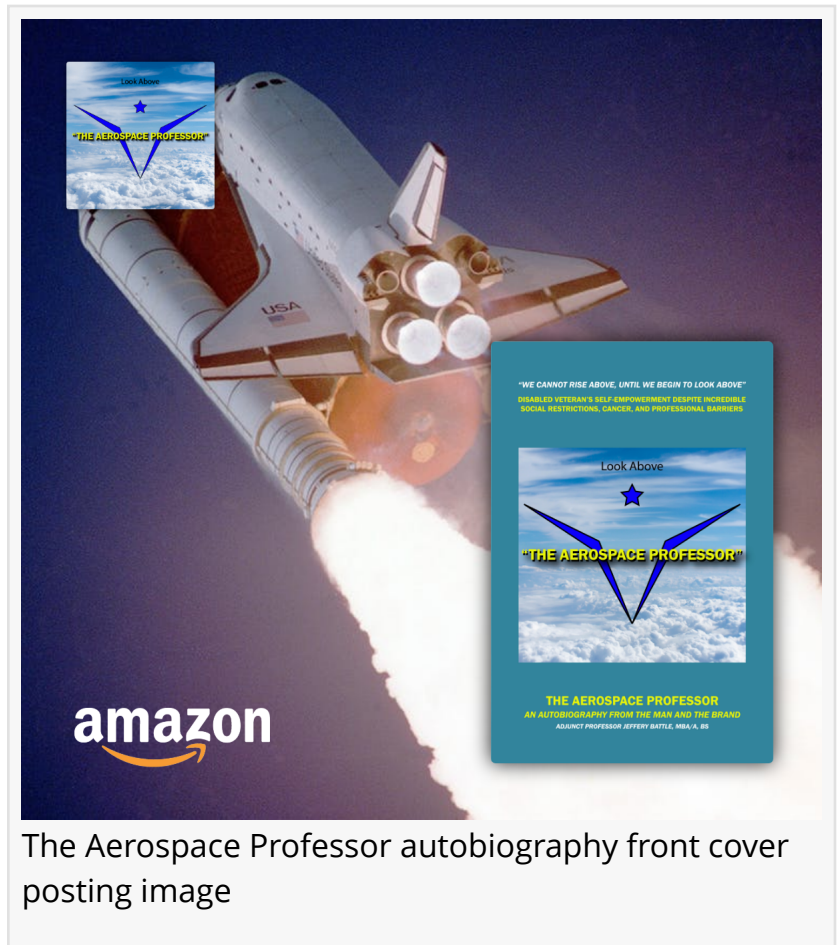
The Aerospace Professor autobiography front cover posting image

This press release can be viewed online at: https://www.einpresswire.com/article/612909272